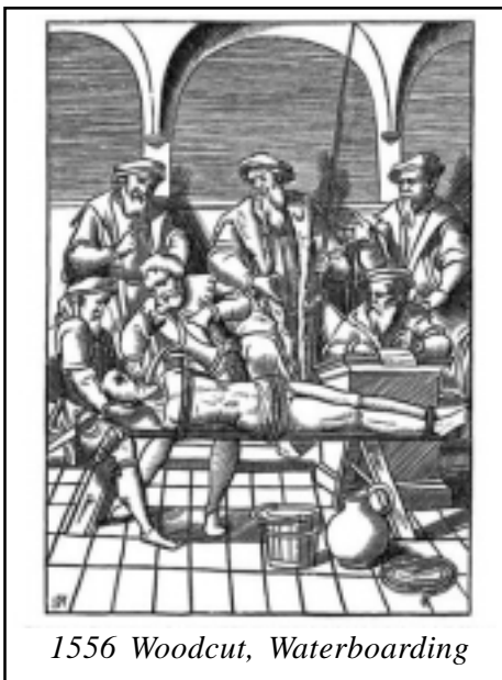
1556 Woodcut, Waterboarding

Torture was quite common in history. In early Athens slaves were always examined by torture, but not free men. Ancient Rome permitted the torture of an accused suspect but not of witnesses except in a case of suspected treason. 5 We are all familiar with the horrors of the Spanish and Italian Inquisitions. In modern times, waterboarding has become a preferred method of torture. The victim is tied or held down on his back and water is poured on or into his mouth and nostrils. He thinks he's drowning, which he is until you stop. Here's an image of a 1556 woodcut depicting waterboarding in Northern Europe. 6